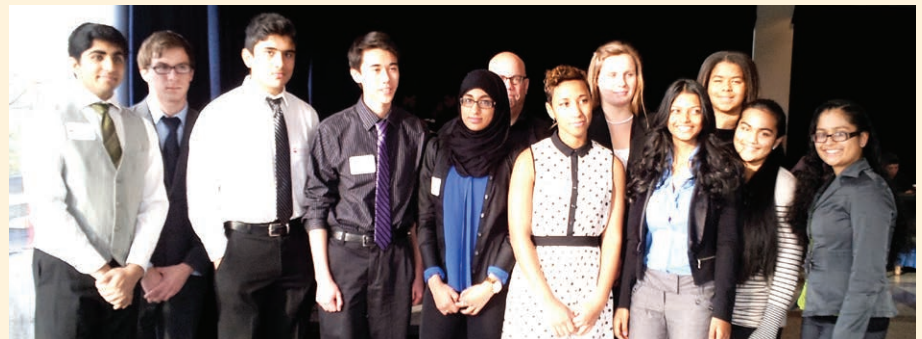
Members of Piscataway High School Debate Teams 1 and 2 competed at the Annual School Ethics Bowl, hosted by the Stevens Institute of Technology.